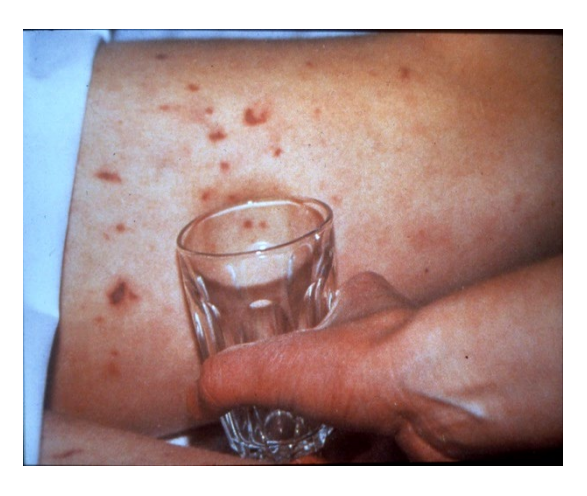
Figure 1 – a non-blanching rash

If your child has a non-blanching rash, seek medical advice immediately.