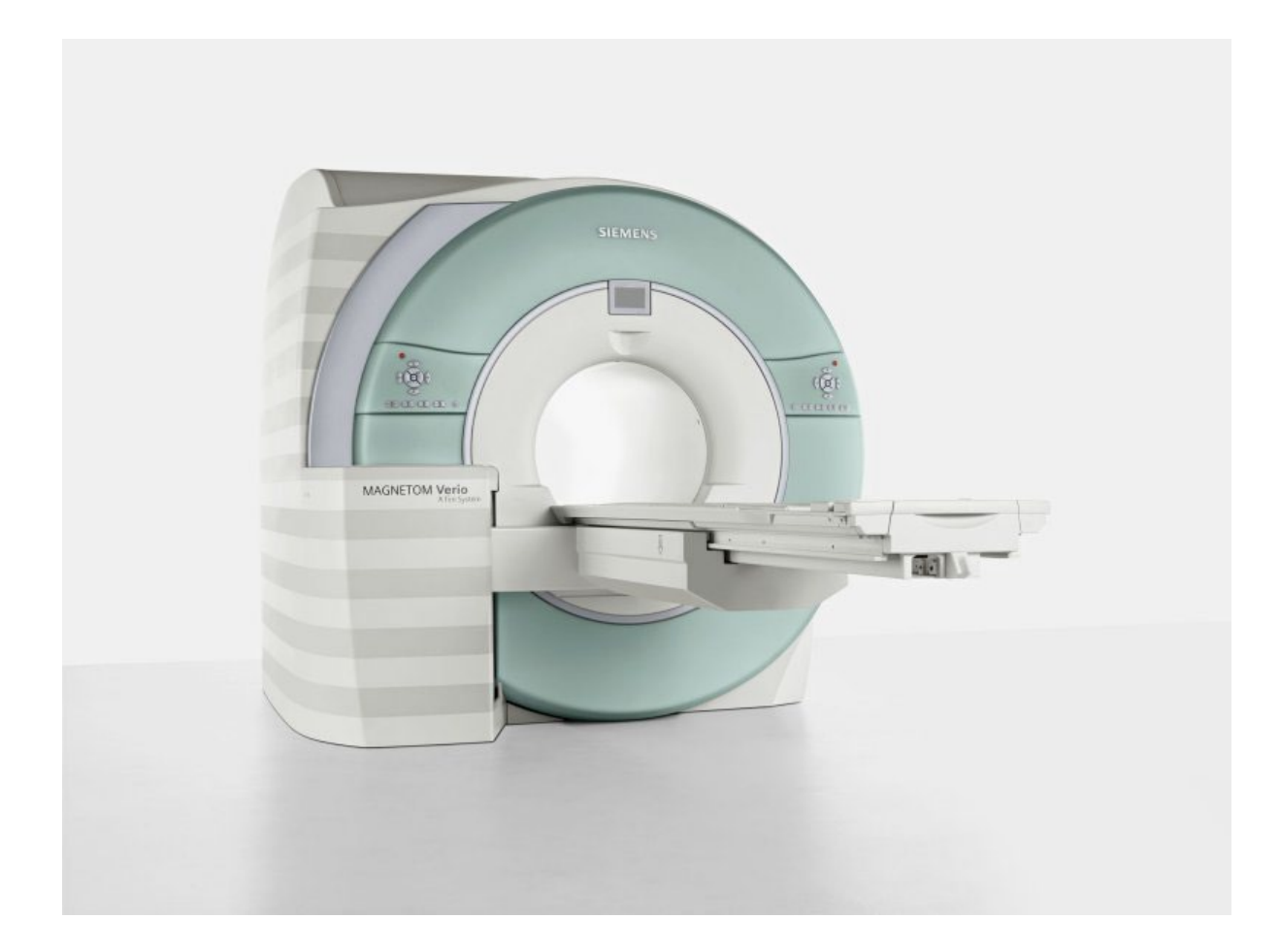
Figure 1 – an MRI scanner

An MRI (magnetic resonance imaging) scan uses strong magnetic fields and radio waves to produce detailed images of parts of the body. An MRI will give much clearer images than an X-ray, CAT scan or ultrasound may be able to give. The MRI scanner is a hollow machine with a tube running horizontally through its middle. Your baby will lie on a bed that slides into the tube (please see figure 1).