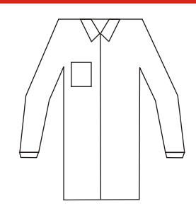
Biomedical Scientist/ Assistant working in laboratory