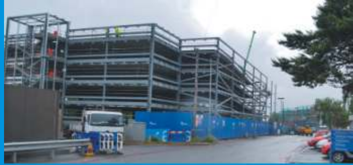
The Artists' impression of how the car park will look once it is finished and how it looks now.