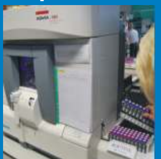
Analysing the specimen The specimens are loaded onto an analyser.