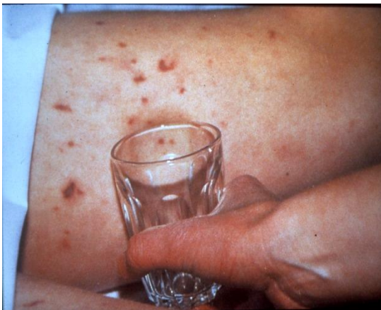
Figure 1 – a non-blanching rash

If your child has a non-blanching rash, seek medical advice immediately.