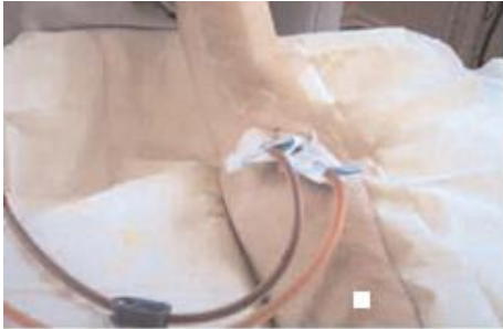
Figure 3a shows needles in an arm graft

For the leg graft, the venous needle is placed pointing towards the groin and the other can be pointing either towards the groin or the foot. This will depend on the blood flow.