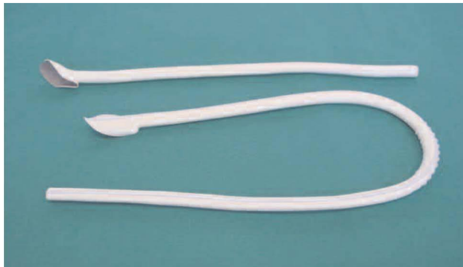
Figure 1 shows straight and loop grafts