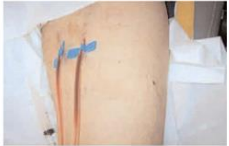
Figure 3b shows needles in a leg graft