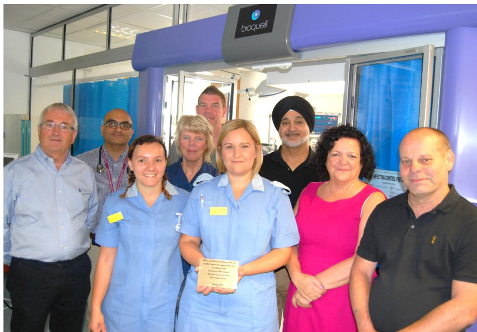
Members of the Goodyear Workers Benevolent Fund met with staff on the Critical Care Unit to see for themselves the huge difference the Bioquell Pod will make

The Trust was delighted to receive a £37,000 grant to support two essential projects at Russell Hall Hospital from the Goodyear Workers Benevolent Fund.