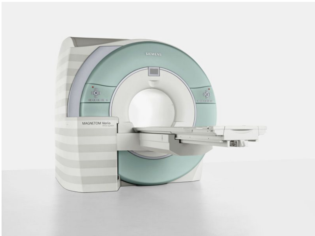
Figure 1 – an MRI scanner

An MRI (magnetic resonance imaging) scan uses strong magnetic fields and radio waves to produce detailed images of parts of the body. An MRI will give much clearer images than an X-ray, CAT scan or ultrasound may be able to give. The MRI scanner is a hollow machine with a tube running horizontally through its middle. Your baby will lie on a bed that slides into the tube (please see figure 1).