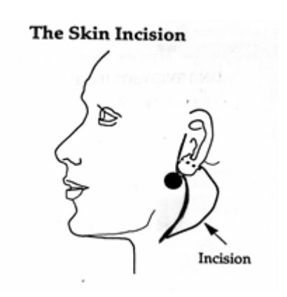
Figure 2 shows the incision made during the operation

During the operation, the main trunk of the facial nerve is exposed and the gland is carefully peeled away from the nerve, taking the lump with it. If the lump is on top of the facial nerve, the deeper half of the gland is usually left behind but if the lump is in the deeper half, more extensive surgery is needed in order to remove the whole gland. Almost always the great auricular nerve has to be divided in order to remove the lump.