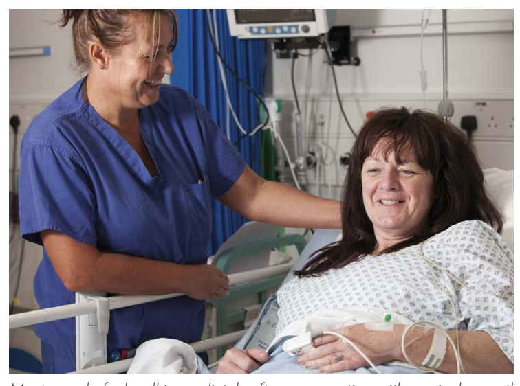
Most people feel well immediately after an operation with a spinal anaesthetic. This lady is in the recovery room with her recovery nurse. Also see photos on page 3 of this patient during her operation, and more information about the recovery room on page 31.

You may notice a warm tingling effect as the anaesthetic starts to take effect. The anaesthetist will not let the operation begin until they are satisfied that the area is numb.