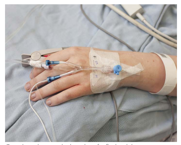
Cannula in place attached to tubing for fluid and drugs

You need to receive fluid during most operations, to prevent dehydration. This fluid may be continued afterwards until the time that you can drink normally. Your anaesthetist can give you sterile water with added salt or sugar through a drip into your cannula to keep the right level of fluids in your body. Any blood you need will also be given through the drip.