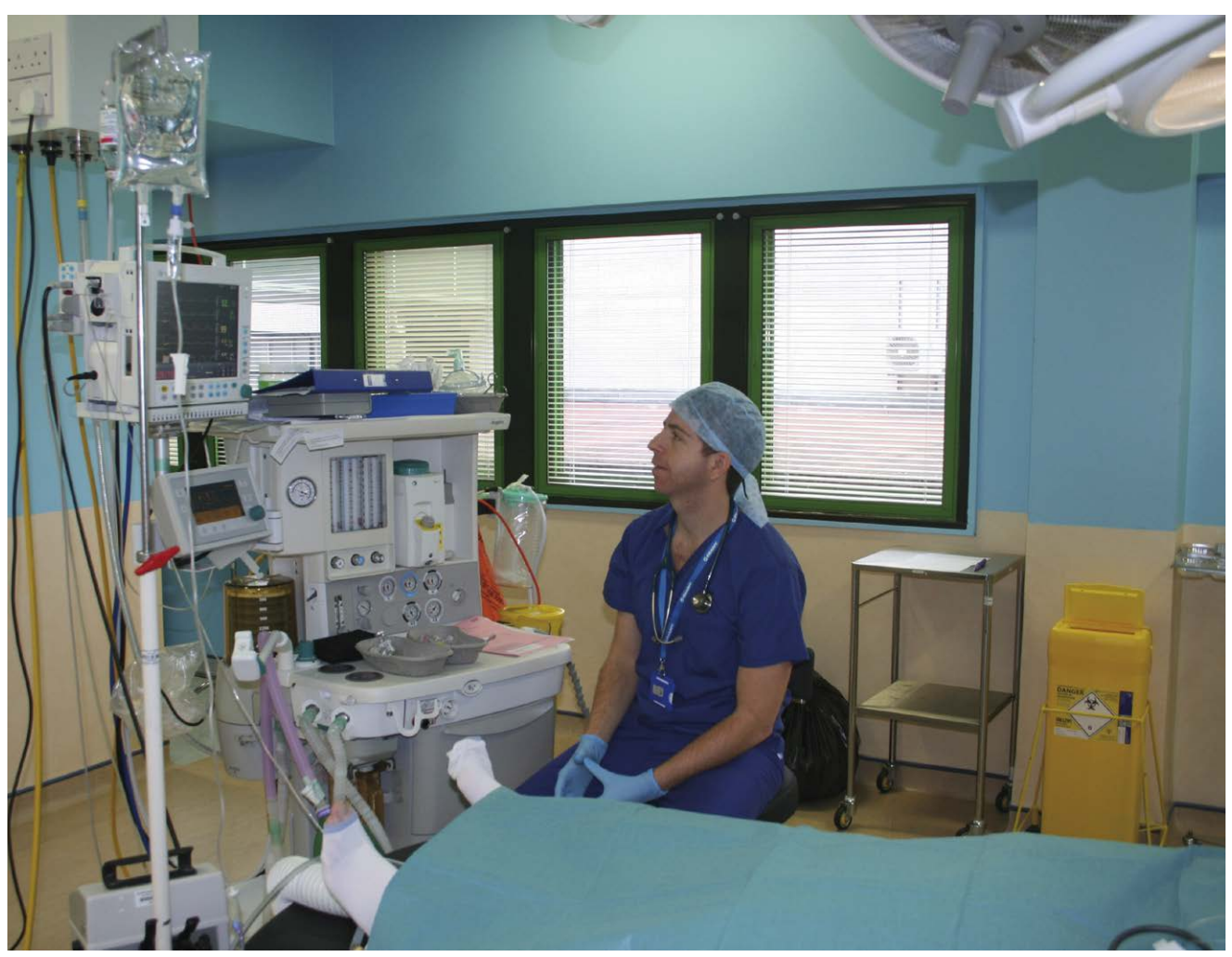
An anaesthetist watching the monitors during anaesthesia with the patient nearby

When your anaesthetist is satisfied that your condition is stable, the monitors will be briefly disconnected and you will be taken into the theatre. Your anaesthetist will stay with you and will constantly be checking that you are responding well to the anaesthetic.