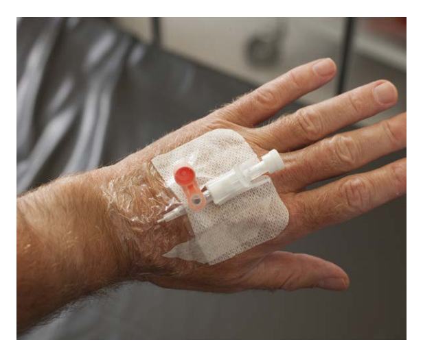
Cannulas are colour coded by size

Sometimes, it can take more than one attempt to insert the cannula. You may be able to choose where your cannula is placed. Occasionally other sites are used, such as the foot.