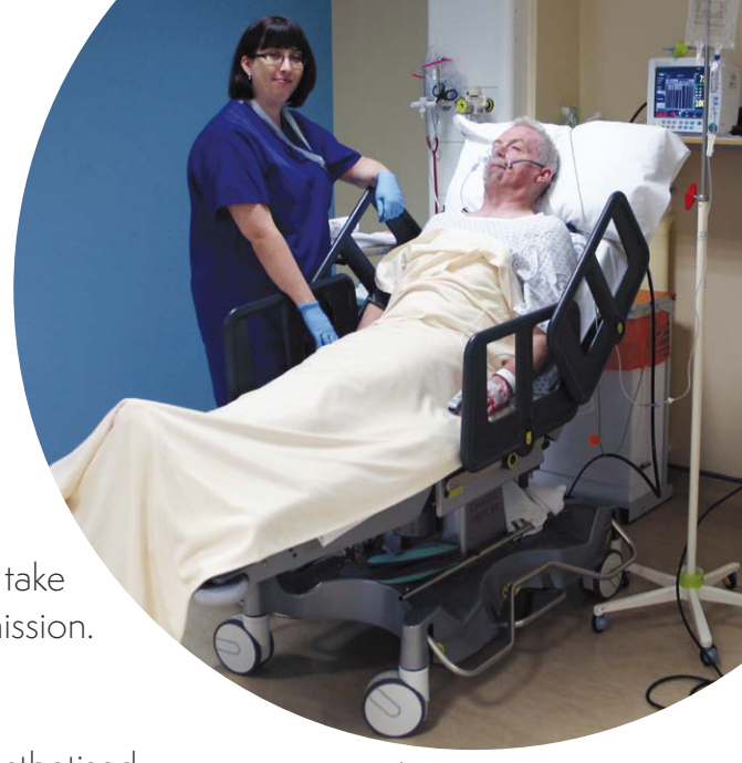
In the Recovery Room

These staff are trained to look after you while you are anaesthetised. An anaesthetist is present at the beginning and the end of the anaesthetic. PA(A)s are not doctors but they have the specialist training needed. They work within strict procedures and they will call an anaesthetist immediately if needed.