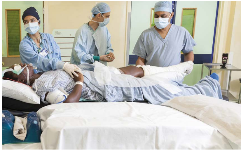
Preparing for surgery – the team is constantly alert to your condition and safety

Anaesthetic techniques are often combined. For example, a regional anaesthetic may be given for pain relief afterwards, and a general anaesthetic makes sure you remember nothing.