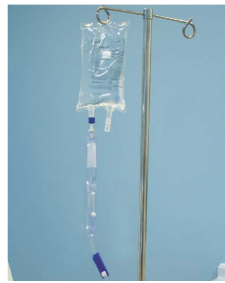
A bag of fluid is attached to the cannula