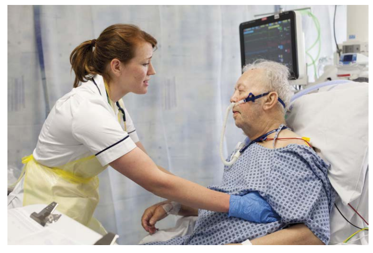
This member of staff is a physiotherapist. She is helping this patient take breaths and expand his lungs fully. Good pain control is essential for this care to be effective.

Not everyone needs to see a physiotherapist for this type of care. Your doctors and nurses will ask for this kind of physiotherapy for you if they think it is needed.