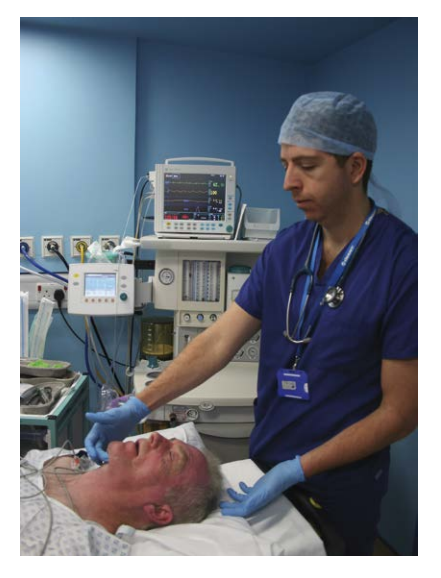
Shortly after the anaesthetic has started (left) and in the operating theatre (below)

Anaesthetic drugs are injected into a vein, or anaesthetic gases are given for the patient to breathe. These drugs stop the brain from responding to sensory messages travelling from nerves in the body.