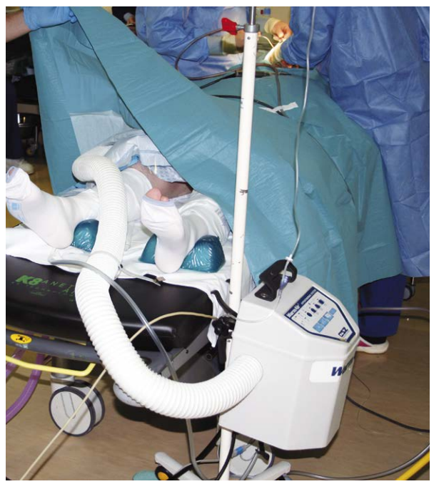
Hot air warming device in use