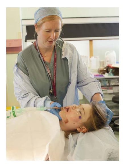
Anaesthetist and patient in theatre (left) and an anaesthetist and anaesthetic nurse with the patient in the operating theatre (below)

Your anaesthetist stays near to you all the time.