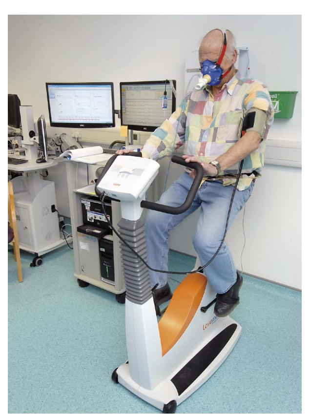
A cardio-pulmonary exercise test

Sometimes the exercise test team will suggest that an activity programme designed to improve fitness would help you get through your operation safely. This would only be if the operation can be safely delayed. Your surgeon would help you arrange this.