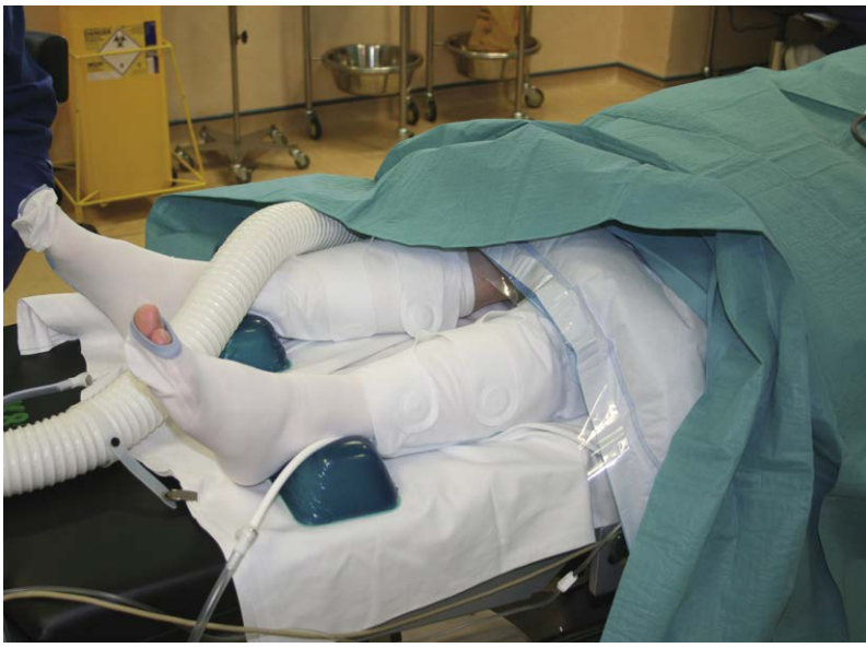
Intermittent calf compression device in use

As well as surgical stockings, the theatre team may also use wraps around your calves or feet which inflate every now and then to move the blood around in your legs.