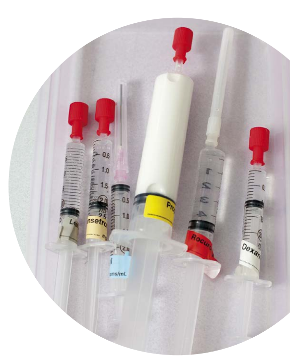
Drugs used during a general anaesthetic