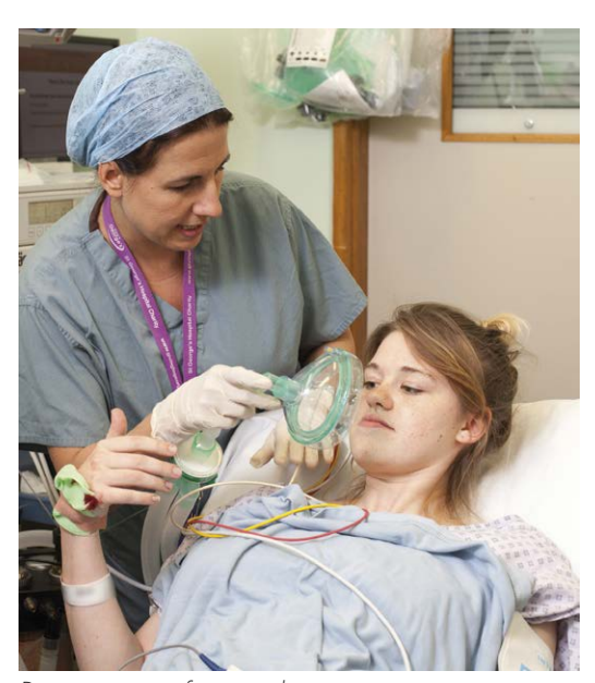
Patient using a face mask

Many anaesthetists will ask you to breathe pure oxygen from a light plastic face mask before the anaesthetic begins. If you are worried about using a face mask, please tell your anaesthetist.