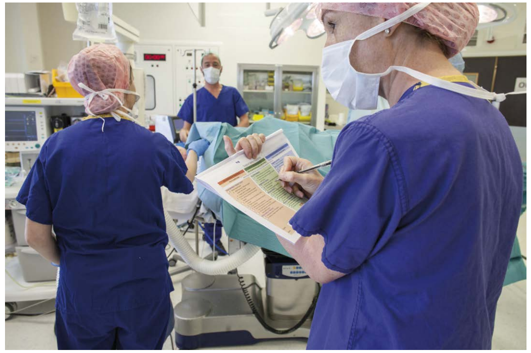
A 'stop' moment for the team as the WHO checks are done

Before the operation begins, the whole team take a moment to make final checks on your care. The World Health Organization (WHO) recommends that these checks happen before every operation.