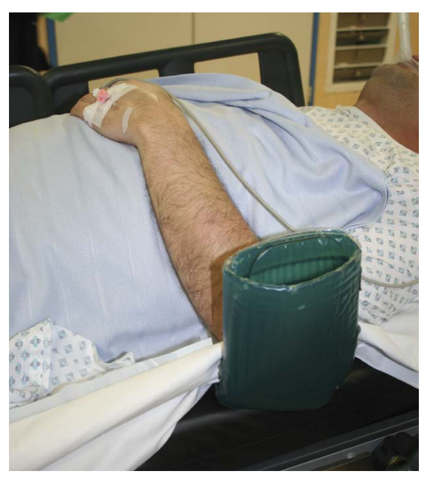
Gel pad to protect the elbow

Your anaesthetist will also make sure that you are positioned as comfortably as possible. Bony parts such as your heels and elbows will be cushioned.