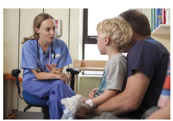
Anaesthetists in training: in the anaesthetic room and out on the ward talking to a patient and his parents