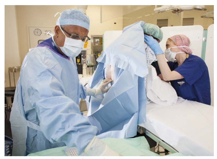
Patient about to have spinal anaesthetic

Local anaesthetic is given into the skin to reduce the pain of the injection. Your anaesthetist will ask you to stay as still as possible and to tell them if you feel any tingling or shock sensations. It can take more than one attempt to get the needle in the right place. If you find this difficult, tell your anaesthetist as there are things they can do to help, including switching to a different kind of anaesthetic.