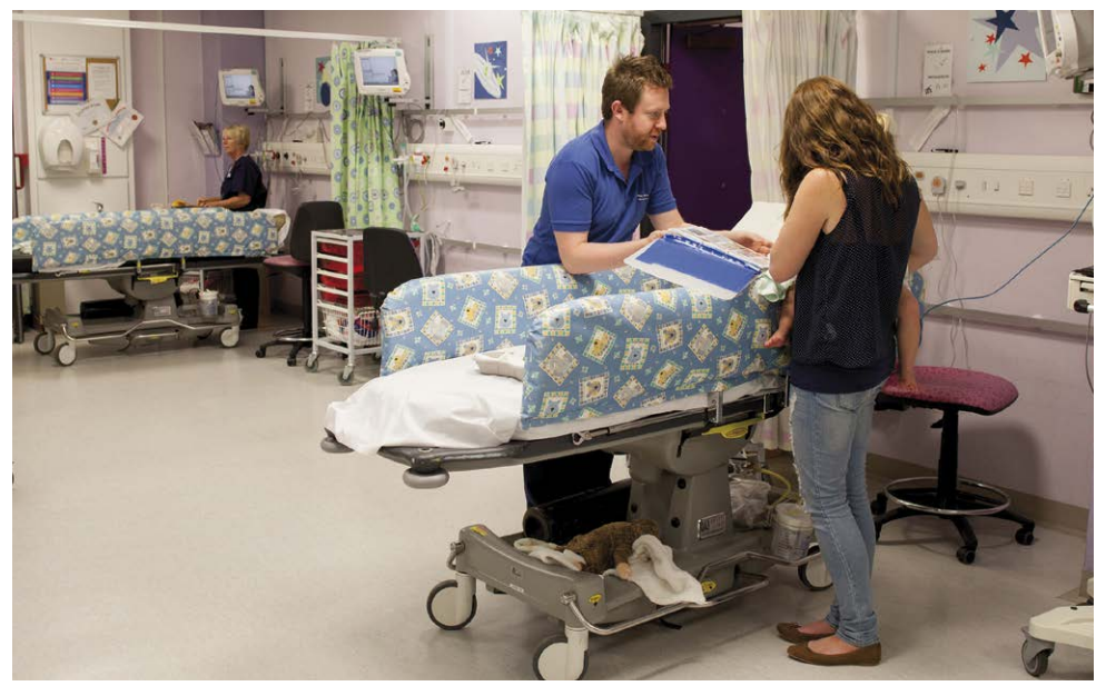
Recovery room with child's mother present

After most anaesthetics you will be cared for in a recovery room. This is close to the operating theatre. Your surgeon or anaesthetist can quickly be told about any change in your condition.