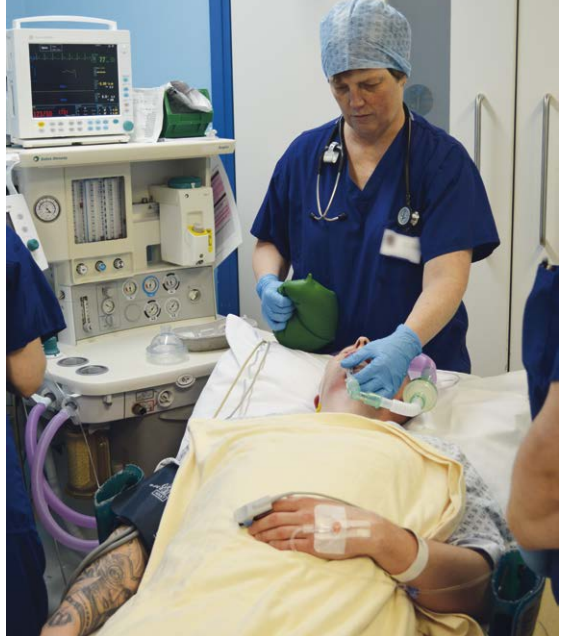
Starting an anaesthetic

Several people will be there, including your anaesthetist and an ODP or anaesthetic nurse (see page 8). There may also be an anaesthetist in training, a nurse from the theatre team and other health professionals who are training.