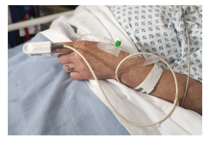
Oxygen level monitor on the finger or toe

Other monitors may be used for complicated surgery. All this information is passed to the screen (below left) so the anaesthetist can quickly see that you are responding well to the anaesthetic.