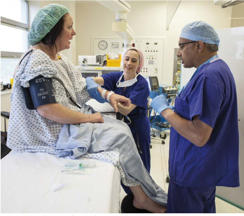
Patient, anaesthetist and anaesthetic practitioner preparing to start a spinal anaesthetic

You will normally have the injection sitting or lying on the trolley or operating table. The anaesthetist and the team will explain what they want you to do.